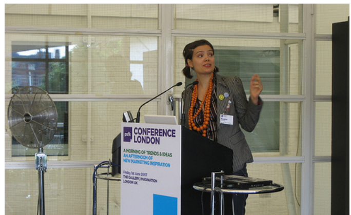
Source: 2008 PSFK Readership Survey